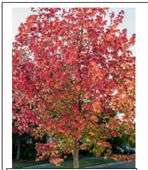
Trident Maple Tree

In the 1940s and the 1950s, streets throughout the Village were lined with trees. While street trees are no longer as prevalent as they once were in the community, the Village has an opportunity to bring some of the scenic beauty back to the area. In 2020, the Board was able to secure 75 street trees to be planted throughout the Village. In connection with Alameda County, the new trees will be purchased and installed free of charge for interested homeowners as part of a grant program. Beginning in March through June, the HOA will arrange for the 15-gallon trees to be planted in homeowner's front yards within the right-of-way. While the London Plane, also known as the San Lorenzo Village Heritage Tree, is the most common type of tree in the community, both the London Plane and the October Glory Maple will be potential options for homes located on the non-power line side of the streets. Homeowner's on the power line side can plant a Trident Maple. Homeowners will be responsible for watering & maintaining the trees.