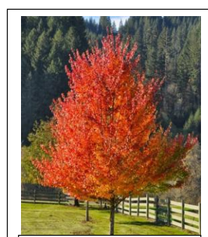
October Glory Maple