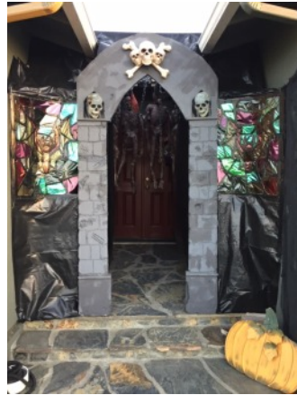
Via Escondido Rio Nickerson